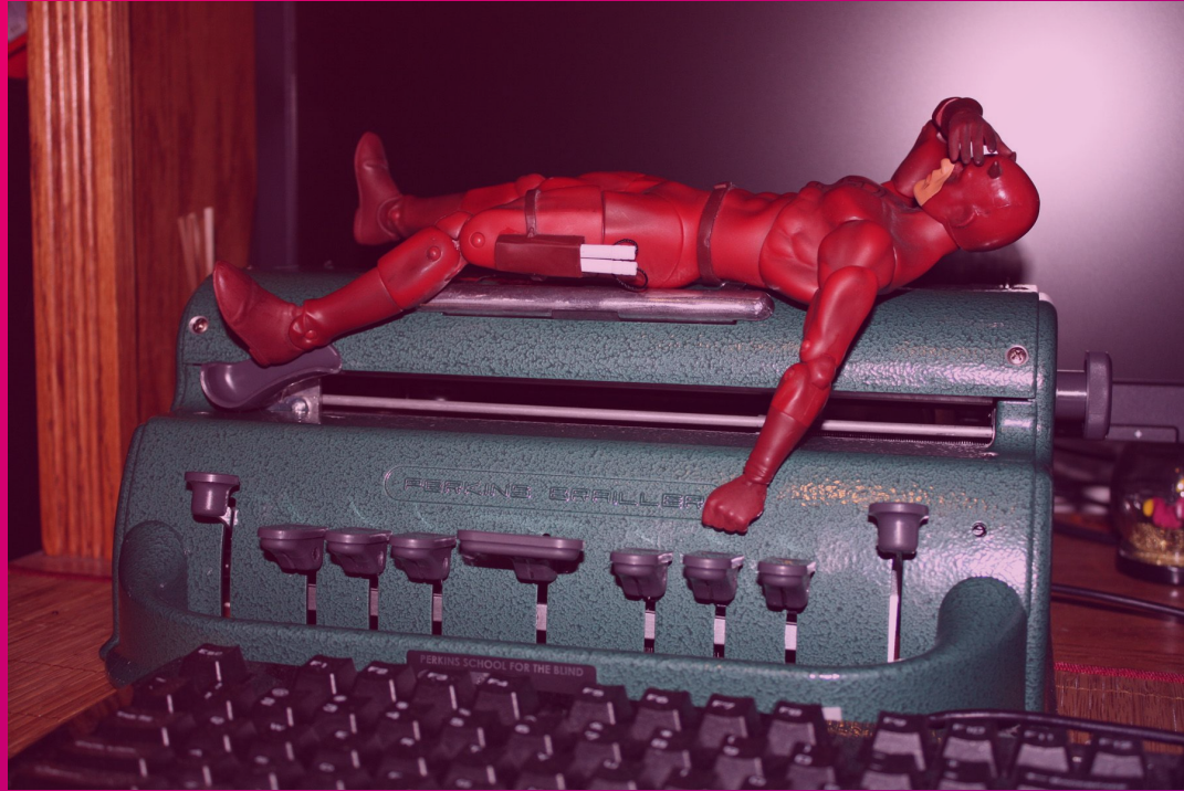
(Picture of a Perkins Braillewriter with a Daredevil action figure on top)