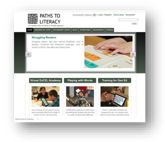
Figure 22 Playing with Words microsite on the Paths to Literacy website.

Can be accessed from the Home page of Paths to Literacy or by going to <a href="https://www.pathstoliteracy.org/playing-words">https://www.pathstoliteracy.org/playing-words</a>