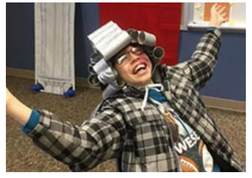
Figure 10 A young boy throws up his hands and laughs while wearing a hat made of toliet paper rolls.