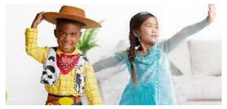
Figure 3 A young boy dressed as Sheriff Woodie from Toy Story and a young girl dressed as the Queen of Arendelle from Frozen.