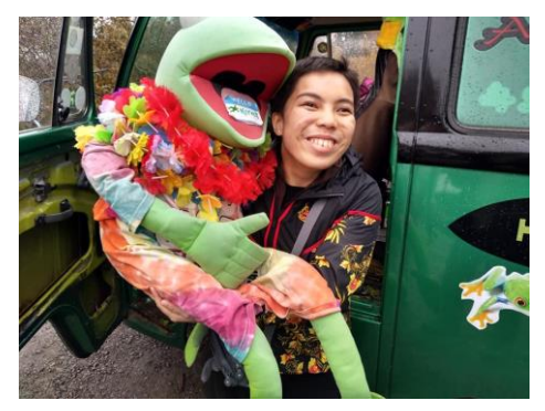
Figure 1 Young woman holding a large Kermit stuffed toy.