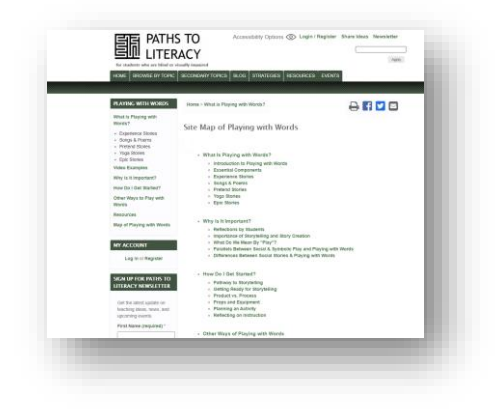
Figure 23 Screen shot of "Map" of the Playing with Words microsite.

https://www.pathstoliteracy.org/playing-words/site-map