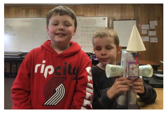
Figure 21 Two young boys. The boy on the right holds a "robot" made from paper cups.