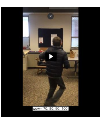
Figure 16 Screen shot from My Brain is an Admiral Washer

https://www.pathstoliteracy.org/playing-words/pretend-stories/my-brain-admiral-washer