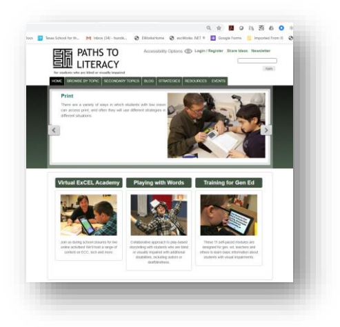
Figure 6 Screen shot of the Paths to Literacy Home page.