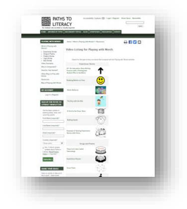
Figure 25 Screen shot of Video Examples from Playing with Words.

https://www.pathstoliteracy.org/playing-words/resources/video-examples