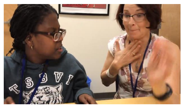
Figure 19 Screen shot of Gabby and Jay from Dogman on Playing with Words.

https://www.pathstoliteracy.org/playing-words/epic-stories/dog-man-story