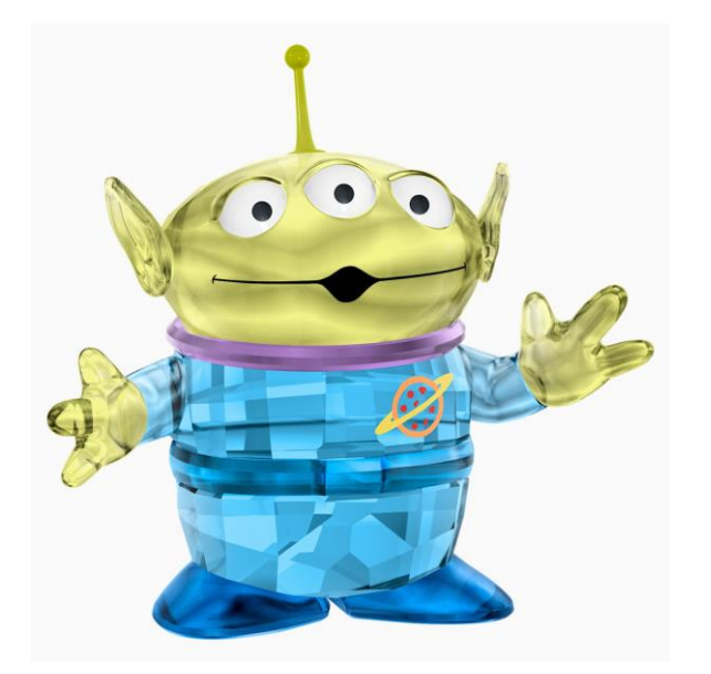
Figure 26 Drawing of 3-eyed alien.