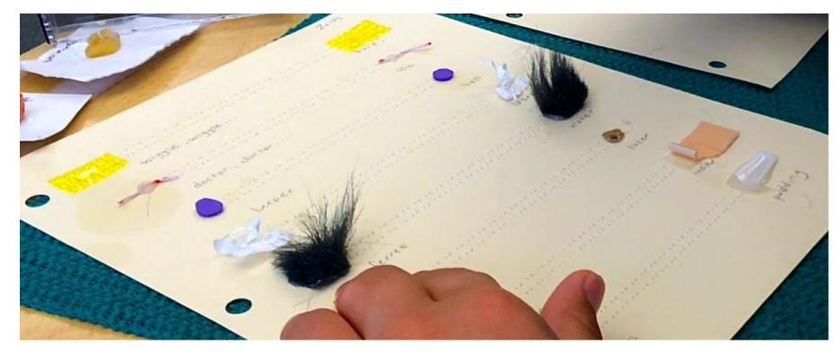
Figure 7 A child's hand explores a page of braille and corresponding tactile symbols.