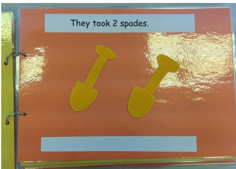
They took 2 spades