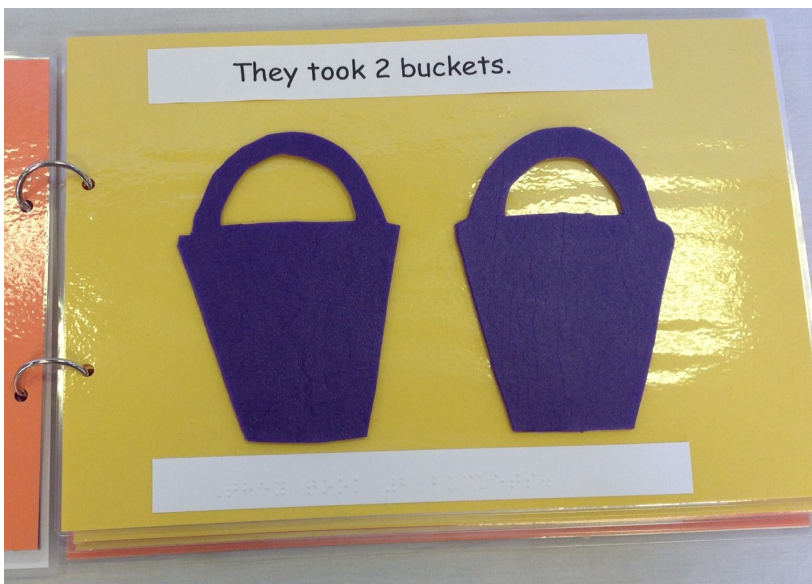
They took 2 buckets