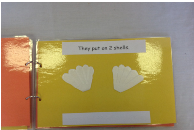
They put on 2 shells